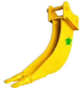
DEEP TRENCH BUCKETS