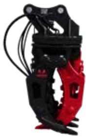
5 FINGER GRAB

Forget the painful delays of having the wrong hitch size or hoses that are too short and let the Astro Team 'deliver, fit and commission'!