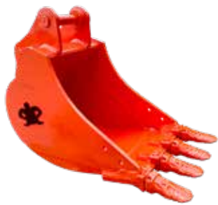
GP & MUD BUCKETS