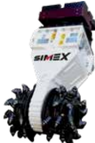
TWIN DRUM CUTTERS